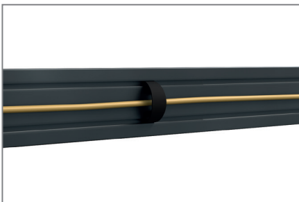
Cable routing with clips