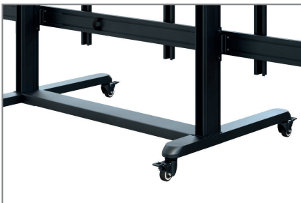
mobile thanks to castors with lock-type brake

In addition to the pre-configured systems, HAGOR offers customised special solutions in the LED sector, which can be individualised with accessories such as loudspeakers, controls and so on to meet all requirements.